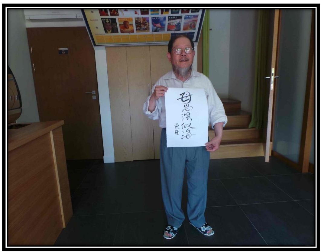
May 26 is Mother's Day in Poland, and disciple Wisdom Lotus asked me to write calligraphy for her mother.