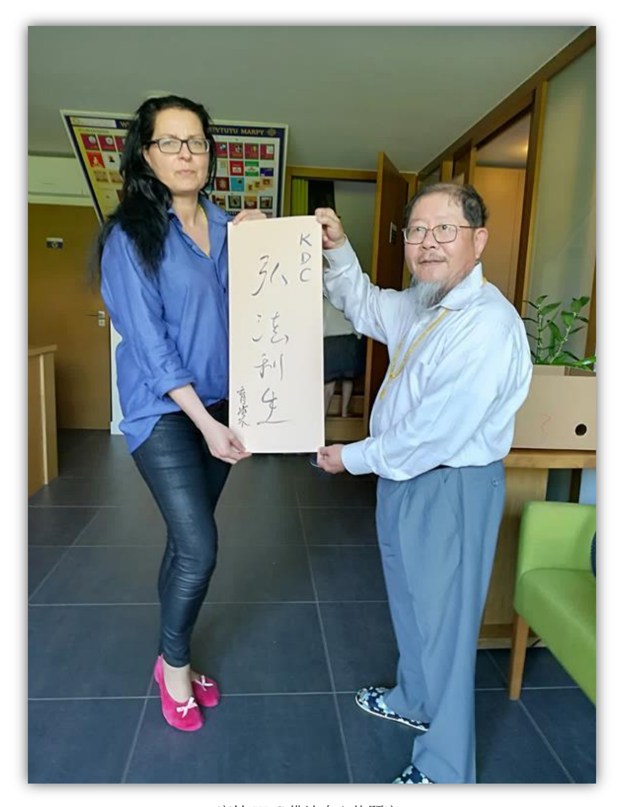
寫給 KDC 佛法中心的題字